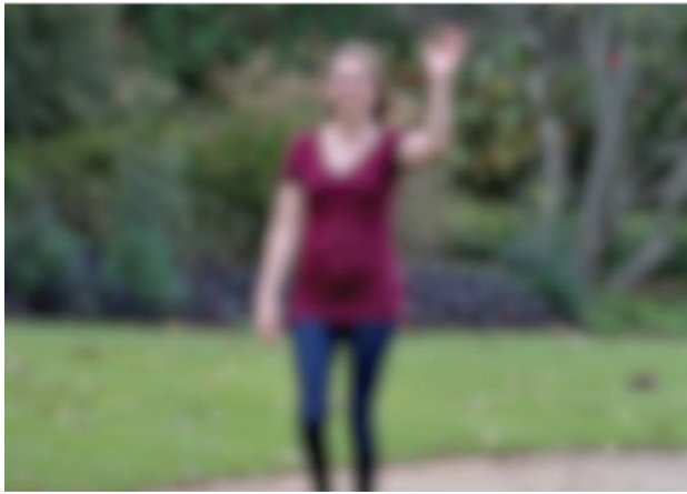
Simulated 20/200 vision