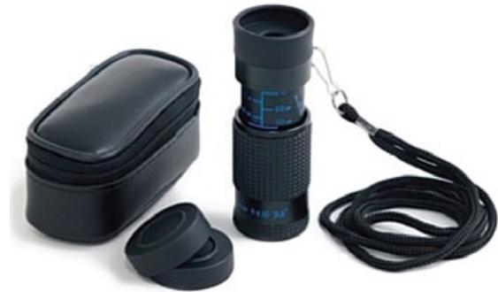
Focusable monocular telescope