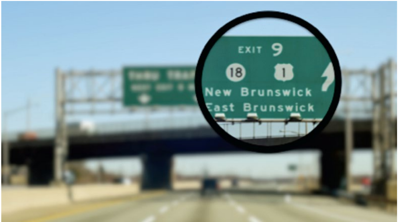
Simulated road view with 20/100 vision using a 3X Bioptic telescope.